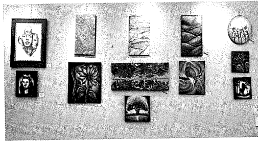
Library Art Wall