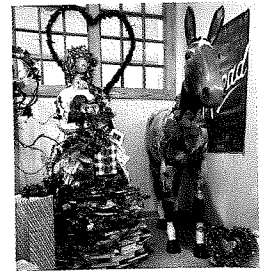
The mule gets dressed for the holidays