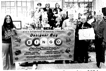
Designer Purse Bingo Committee 2024